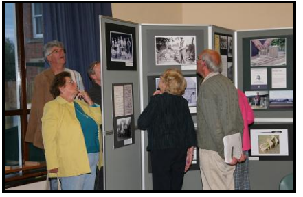
Guests look at the exhibition after the talks.