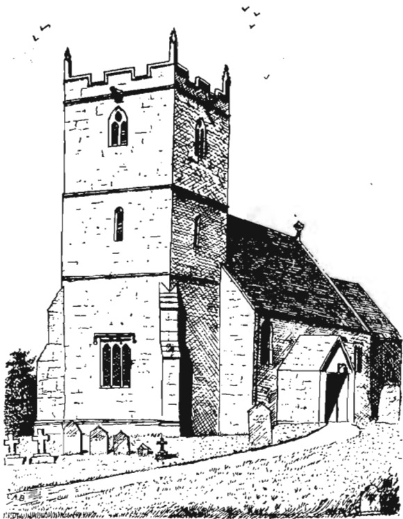
St. John the Baptist Church WICKHAMFORD