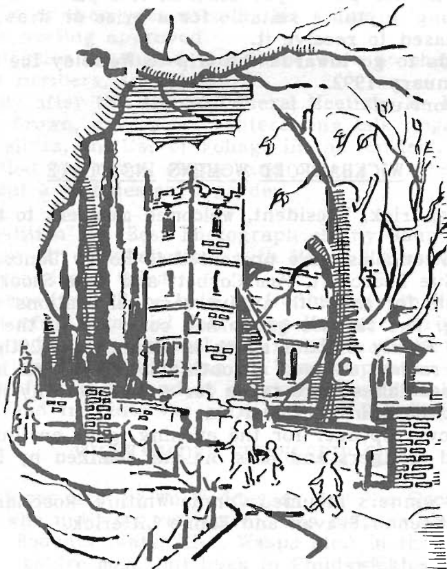
CHURCH OF ST. JOHN THE BAPTIST • WICKHAMFORD •

A vicar got carried away during a sermon. He cried out, "Lord give them pure hearts, Lord give them clean hearts, Lord give them sweet hearts."