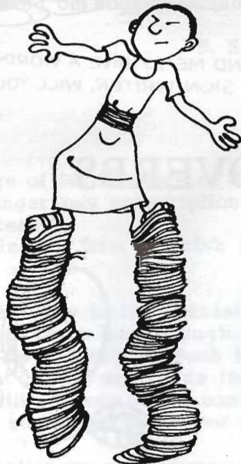
Japanese Proverb: The go-between wears a thousand sandals.