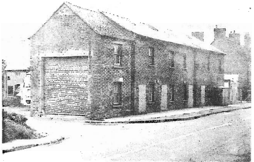
The picture shows Brefforton Road and the site of Hither Green.