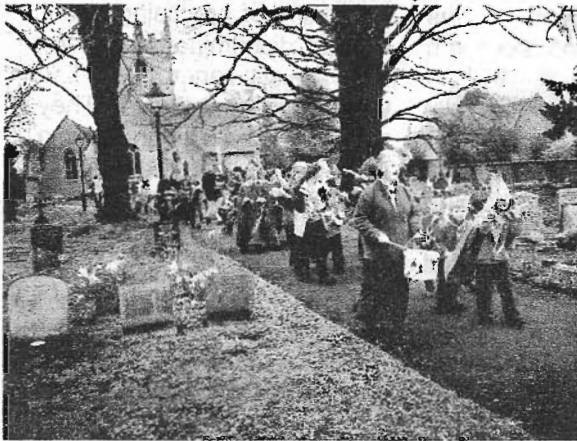
PALM SUNDAY PICTURES