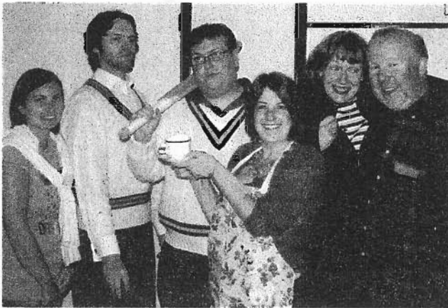
In the photo :