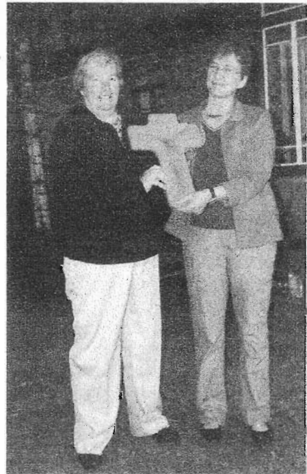
Two photos - one of the presentation of the cross the other the group a Hontensleben Border Memorial.

For a sympathetic and respectful service contact: