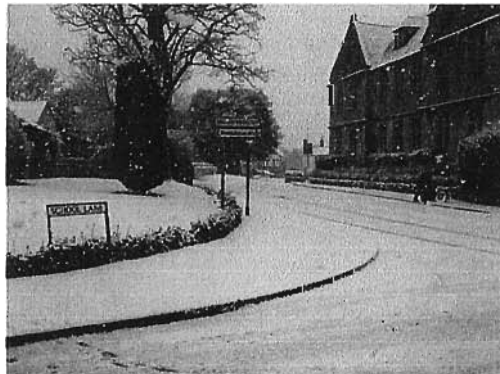
January 2010

Ok, not that hard really but worth the effort! Let me know how it goes won't you?