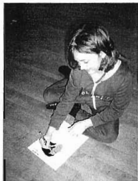
On the left a Brownie colouring in a picture of Robbie Burns