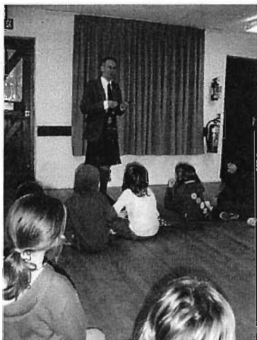
On the right the vicar is explaining his Scottish attire.