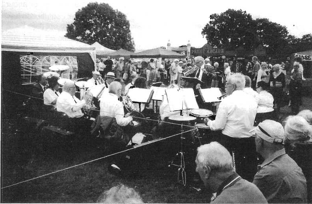
Celebration Reed and Brass Band