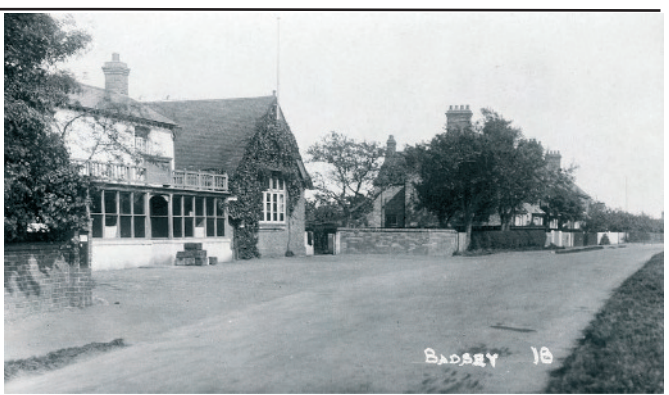
The Royal Oak before it became The Round O' Gras