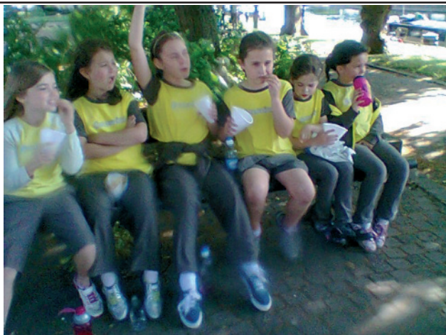
Badsey Brownies enjoying chips after their boat trip

Contact phone number: 01386 832 755 or 01386 424429