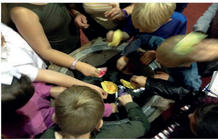
Jesus calms the storm.

The Jigsaw group drew some very colourful storm pictures. Percussion instruments were used to fill the church with the noise of the storm. A young leader tried to control the storm like a conductor controlling the orchestra and we saw how powerful God must be. We thought about the storms around the world and the people affected in many ways. The children wrote prayers and folded them into paper boats which floated on the font.