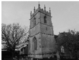
St. James, Badsey and Aldington