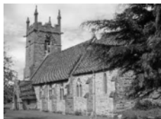
St. Mary & St. Milburgh, Offenham