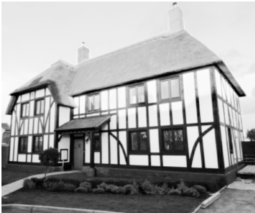
Kingshurst Gardens, Bretforton Road, Badsey