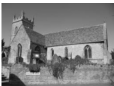
St. Leonards, Bretforton