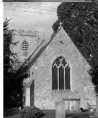
St. Michael the Archangel, South Littleton