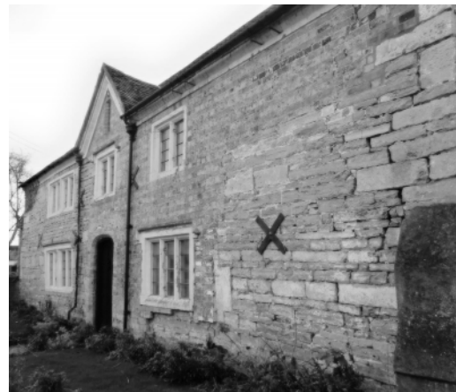
No. 18 High Street Badsey

As they walked along the country lanes, children would pick wild flowers or violets to take to church or give to their mother as a small gift.