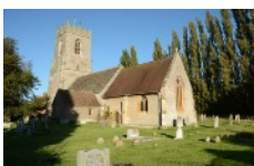
St. Andrew, Cleeve Prior