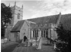
St. Nicholas, Middle & North Littleton

So, if you have any thoughts or ideas about what the future of our churches might look like, please do get in touch.