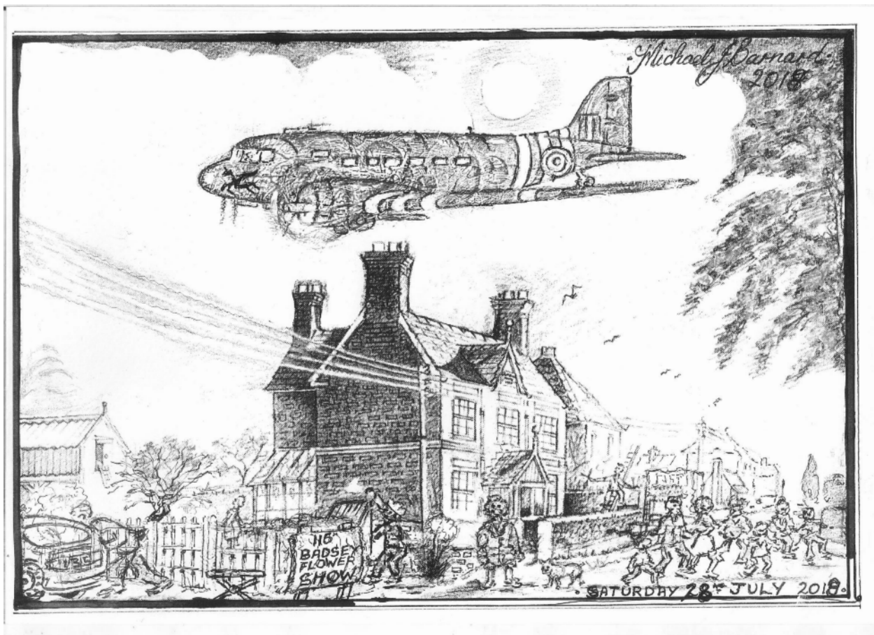
116 th Badsey Flower Show

Part of the Benefice of East Vale and Avon