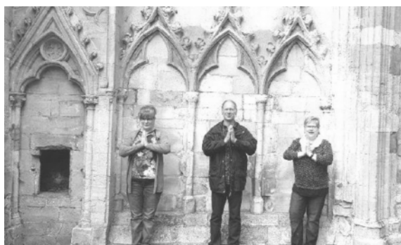
Church members from Salzweden visiting Pershore Abbey

The Magdeburg Diocese thanks God for the joy of sharing in worship, fellowship and fun together.