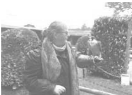
Church members from Barby near Magdeburg, visiting the Cotswold Falconry Centre at Moreton in Marsh