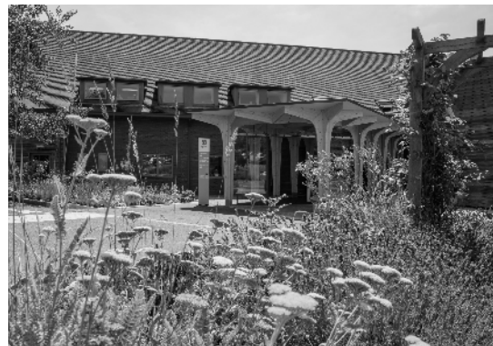
Photo: St Richards Hospice entrance, Worcester

"I am come to calm your fears: I am come to console you in the absence of bright days, and to reassure you of their return." (The Snowdrop – Consolation by Bishop Keble 1792-1886).