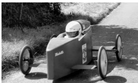
Badsey Soapbox Races 2019