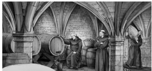
The Worcester Cathedral cellars in medieval times would have looked much like the above image portrays: Monks looking after their wine

Worcester Cathedral has a vibrant community that serves the city and the diocese of Worcester. It attracts over 300,000 global visitors each year. In 2017, the Cathedral was voted into the top 10 of the UK's free to visit tourist attractions