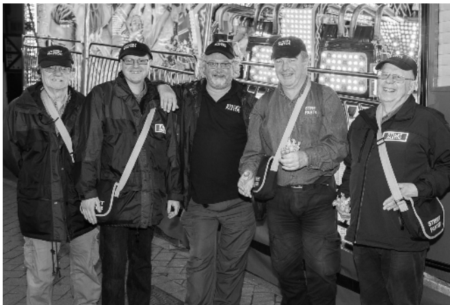
Evesham Street Pastors

We are a Christian mission organisation and are delighted to be able to share something of the love of Jesus with those enjoying the nightlife of our town. One of our team is a professional video producer, we therefore have a great video and if there is an opportunity to show this at your church or group we would be delighted to share more about the work we do.