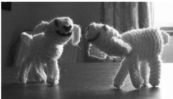
The Knitted Bible