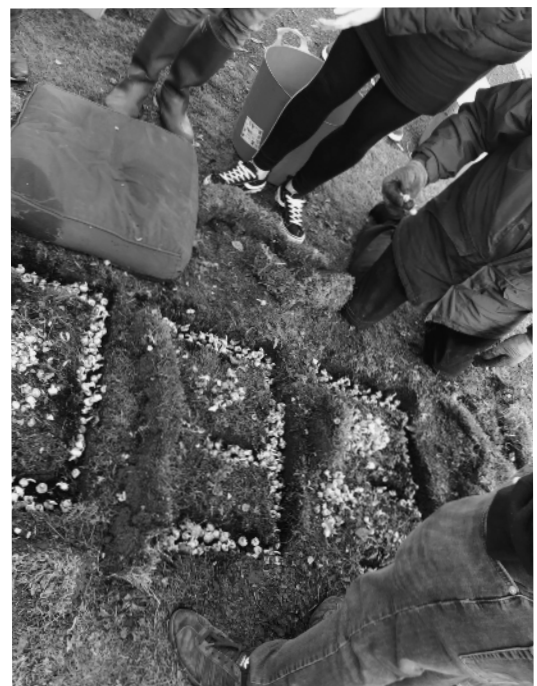
Lots of hard work going on to plant so many crocuses