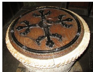
North and Middle Littleton church font (left) and South Littleton font cover (above).