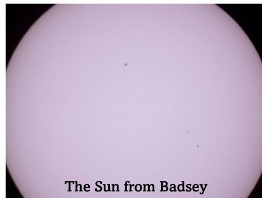
The Sun from Badsey

There are two safe methods of observing the sun. Firstly, by buying expensive specialist filters for the front of your telescope or binoculars. The second is to project an image through a pin hole and look at this projected image.