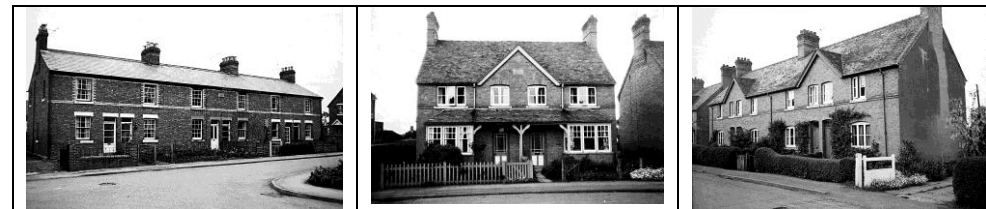
Houses on the north side of Brewers Lane, built 1893-1903, taken in 1968 by Birmingham Photographic Club: 13-23 (South View Terrace); 33-35 (Tower View); 37-43 (Fair View).