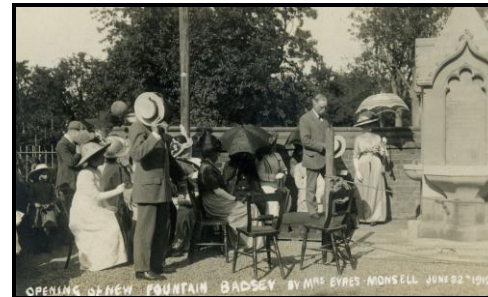
June 1912 – a hot summer's day with parasols.