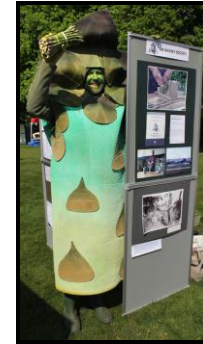
Gus the Asparagus.