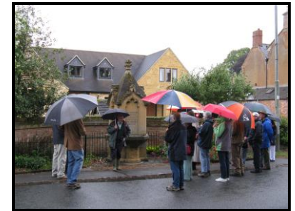
June 2011 – a cold, damp day with umbrellas!