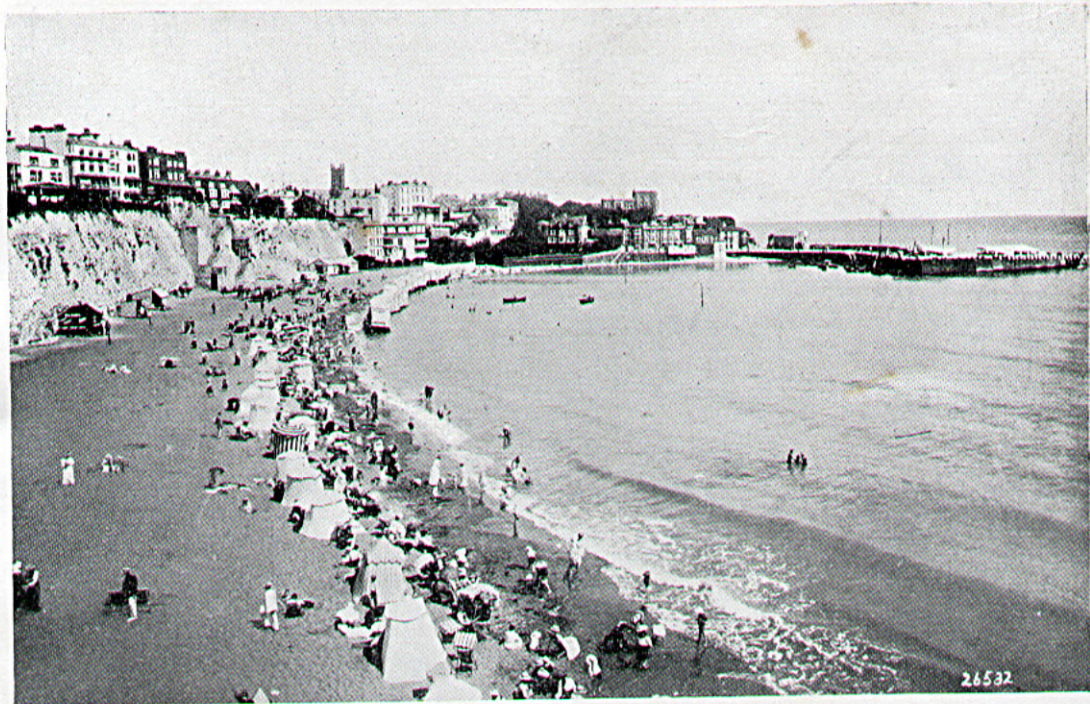
The Beach, Broadstairs