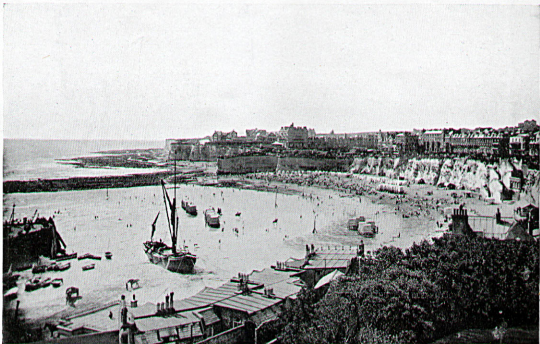
Broadstairs, from Bleak House