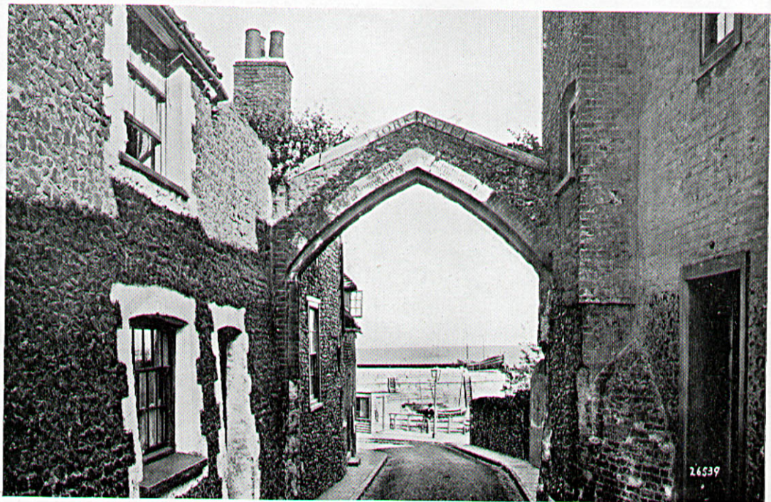
York Gate, Broadstairs