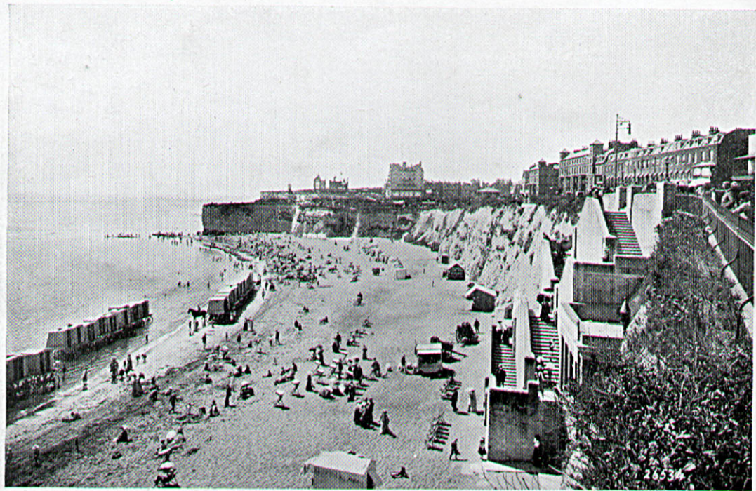
The Bay, Broadstairs