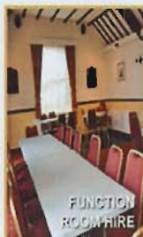
FUNCTION ROOM HIRE