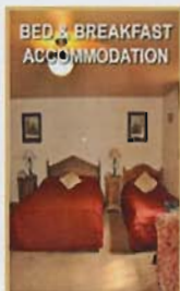
BED & BREAKFAST ACCOMMODATION