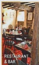
RESTAURANT & BAR