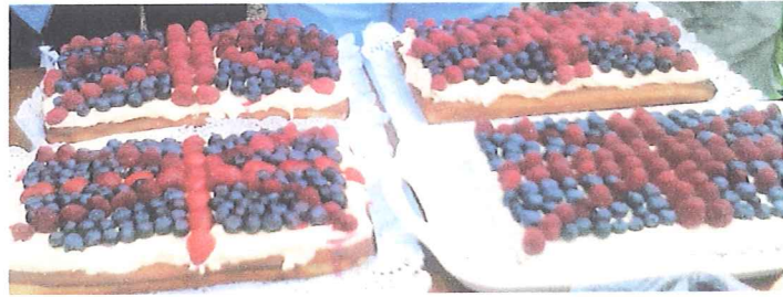
The secret Flan base recipe included yoghurt, and ground almonds. Blueberries, strawberries and raspberries completed the decoration on a layer of whipped cream.