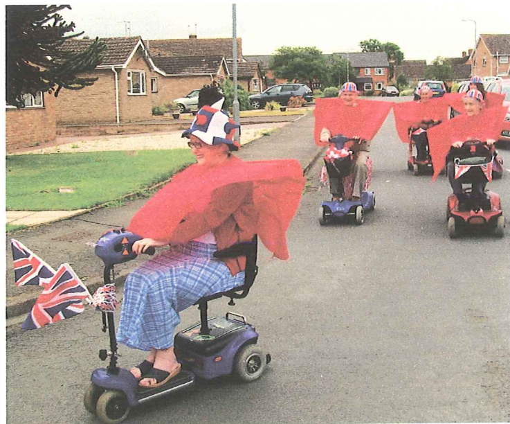
The Road was closed to allow a smooth fly past