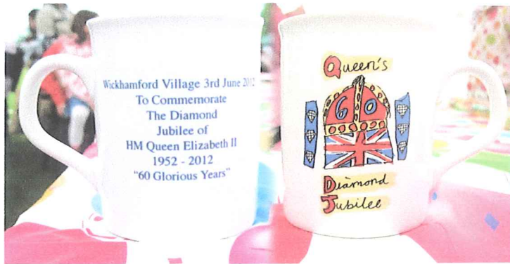
DIAMOND JUBILEE MUGS