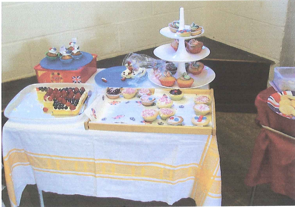
Above: Lots of home baking for the children, on red, white and blue plates