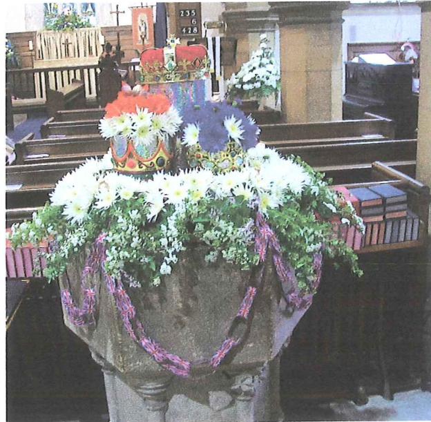
Badsey Church Font

Below: Badsey Butcher decided to join in the celebrations and decorate the shop window with Union Jacks. To celebrate, they were selling Scotch Beef for only £10.50 per Kg