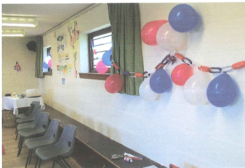
Below: The inside of the Scout Hut is decorated with red, white and blue balloons,. Very traditional.