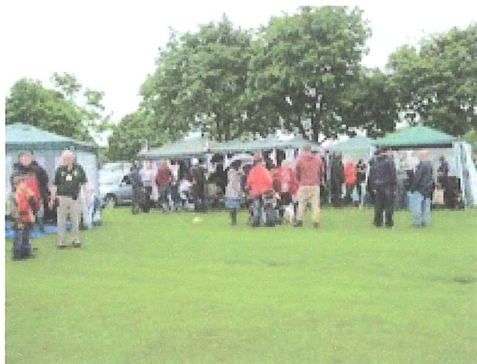
HIGH SPIRITS, DESPITE THE COLD AND RAIN