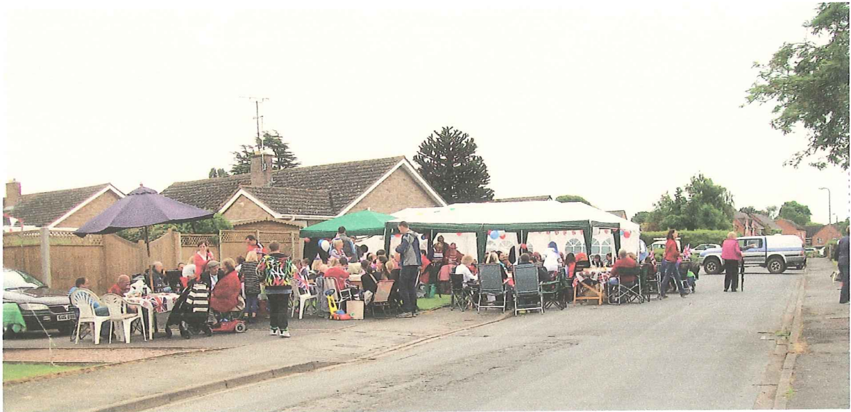
Everyone is settling down to enjoy the music, laughter and celebrations in Seward Road