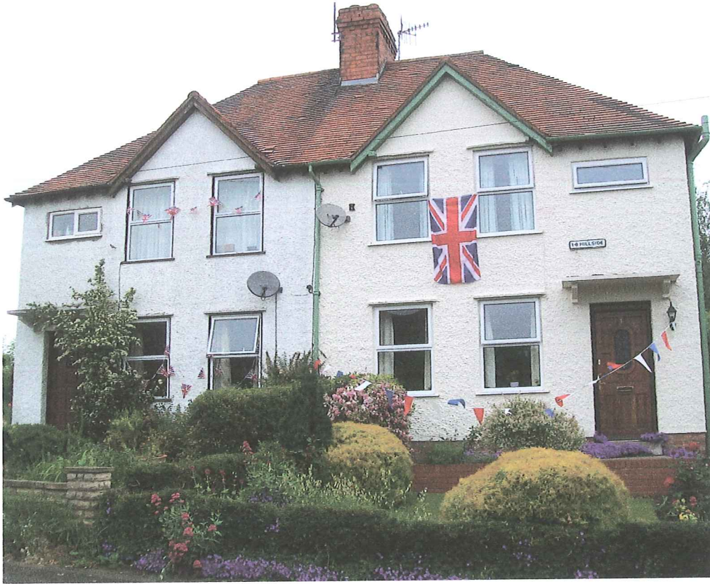
Below, right wing of The Firs, Main Street, home of Robin and Jane Neill, flying the flags

Aldington hangs out the Flags in Main Street