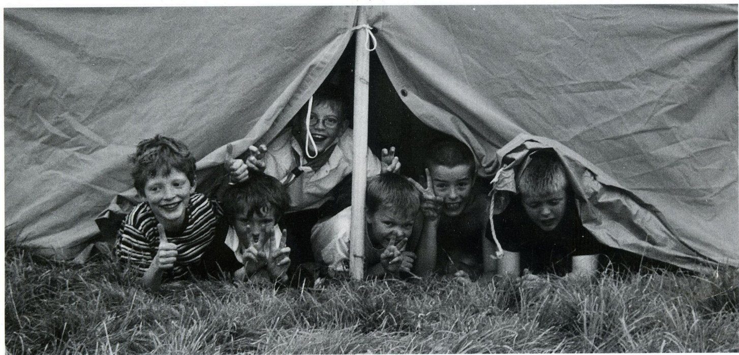
1st Badsey Cub Scouts Summer Camp - see Cub Scout Section

2,100 Copies of each Issue destined for over 6,000 Members of the Movement in the County. Registered Charity No. 505004