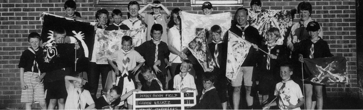
Team Photo outside the 1st Badsey Scout Hut