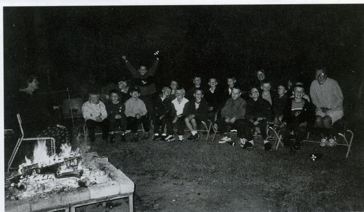
Everyone enjoying the camp fire singing