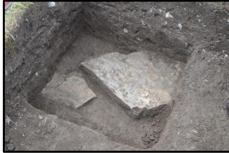
By the end of Day 2, what appears to be a wall (possibly medieval) had been uncovered.