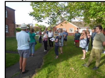
Silk Mill Cottages, Badsey – now the location of four cottages. In 1921 there were once ten cottages here.